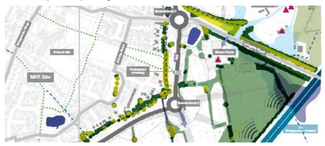
Figure 5- Extract from Constraints and Opportunities Plan.

The above is also at odds with the rationale set out in the Constraints and Opportunities Plan in Part 2 of the DGMF, as shown below, that highlights the potential for Manor Farm to provide a point of access into the phase, with the Concept Masterplan in chapter 5 stating that a small part of the employment area will be accessed at this point to minimise traffic created along this road, yet is further away from key strategic traffic routes.