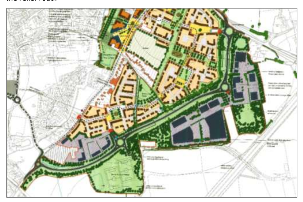
Figure 4- Extract from masterplan for application ref: 48/05/0072.

phase 1 of the Monkton Heathfield Development that includes employment use along the east side of the relief road.