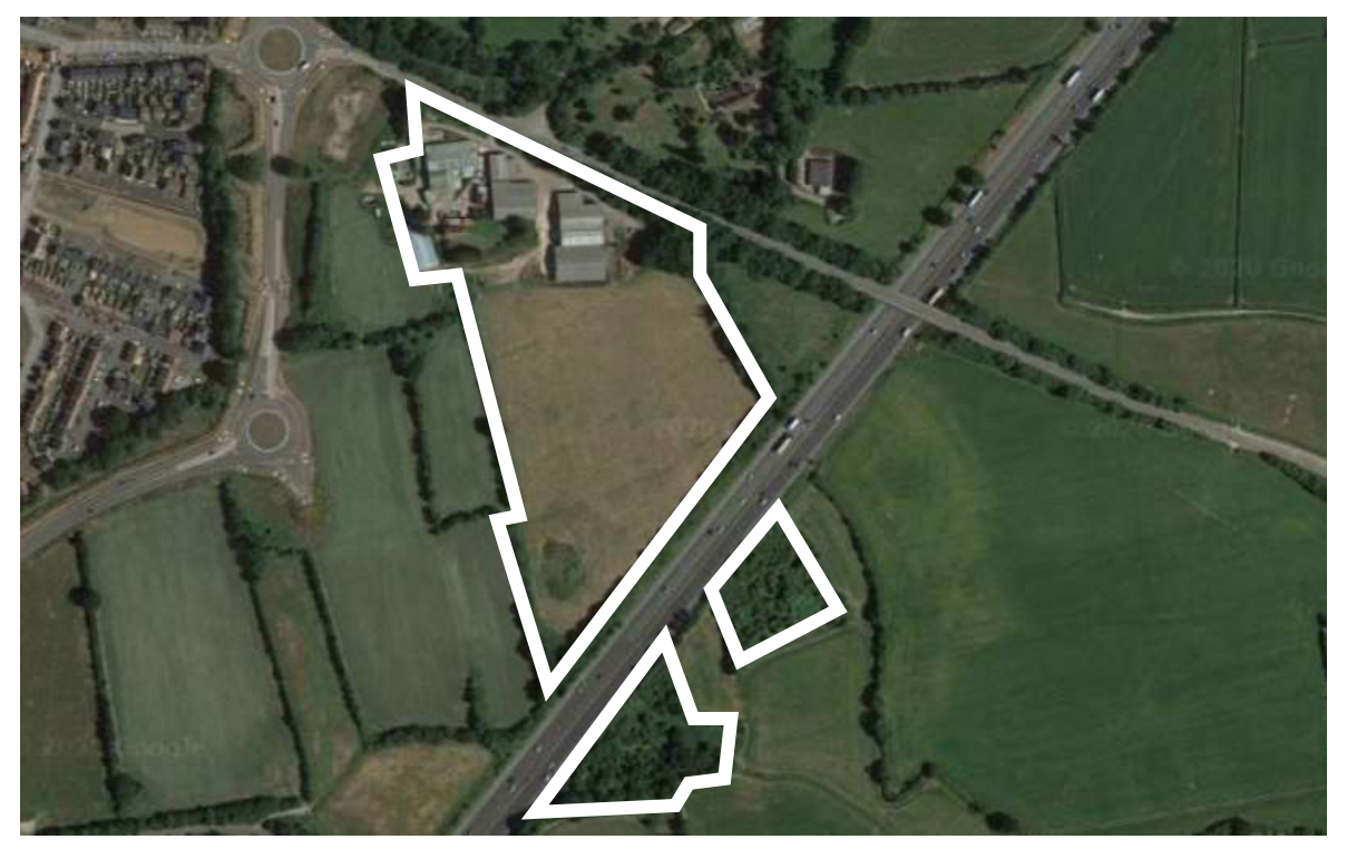
Figure 1- Aerial image of The Land in client's ownership (indicatively outlined in white for reference).

The Land in our client's ownership is outlined indicatively below white (referred to as 'The Land' hereafter). The Land comprises of 13.8 acres of agricultural land that is split by the M5 motorway. The majority of the site is accessed from the west side in close proximity to the relief road constructed as part of the Monkton Heathfield development.